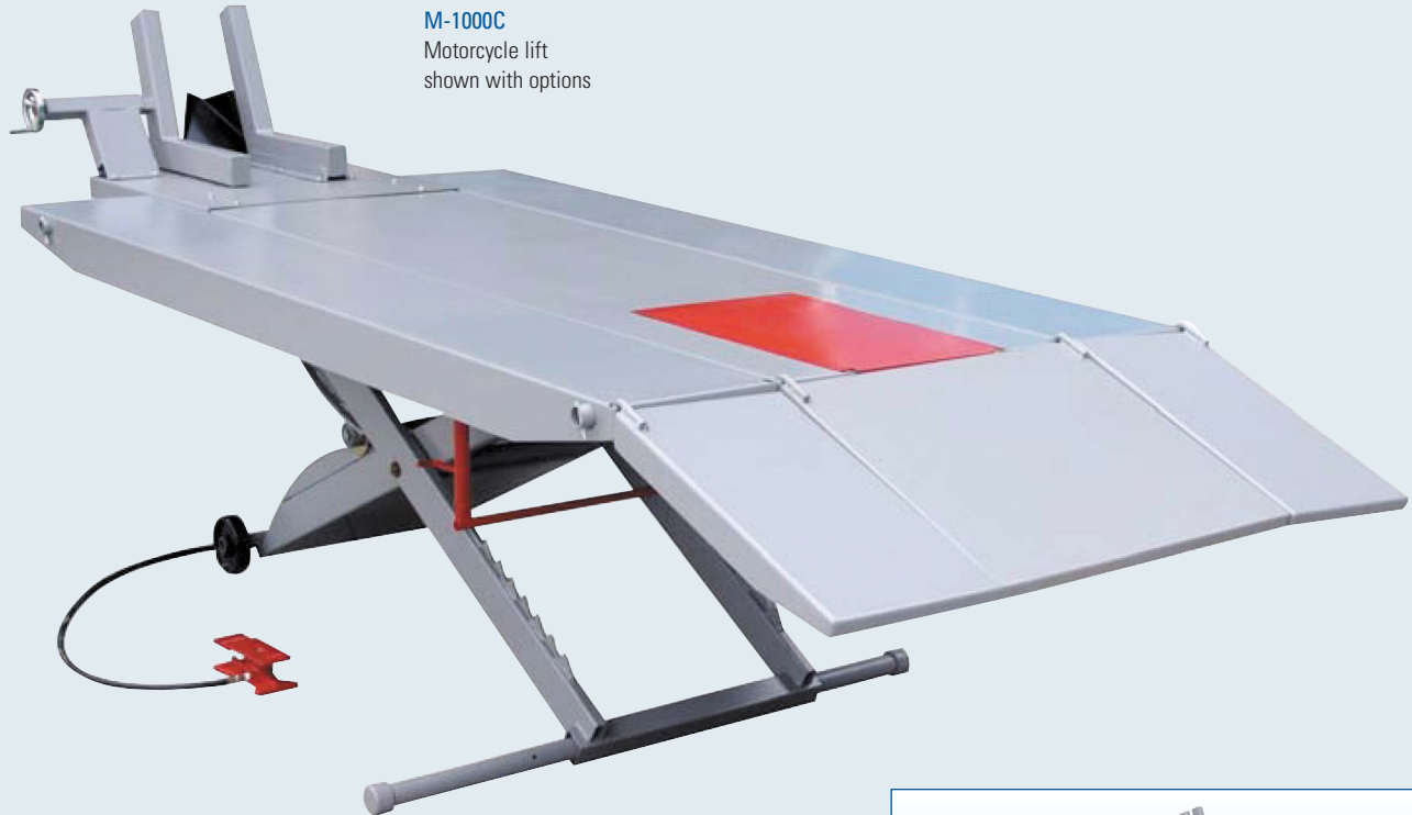
M-1000C Motorcycle lift shown with options

This air powered lift table is ideal for making repairs to motorcycles, snowmobiles, ATVs, jet skis, etc. The 1,000 lb. capacity, extra large platform brings all your jobs to a comfortable 30" working height. Choose from a range of accessories to customize this table for your shop.